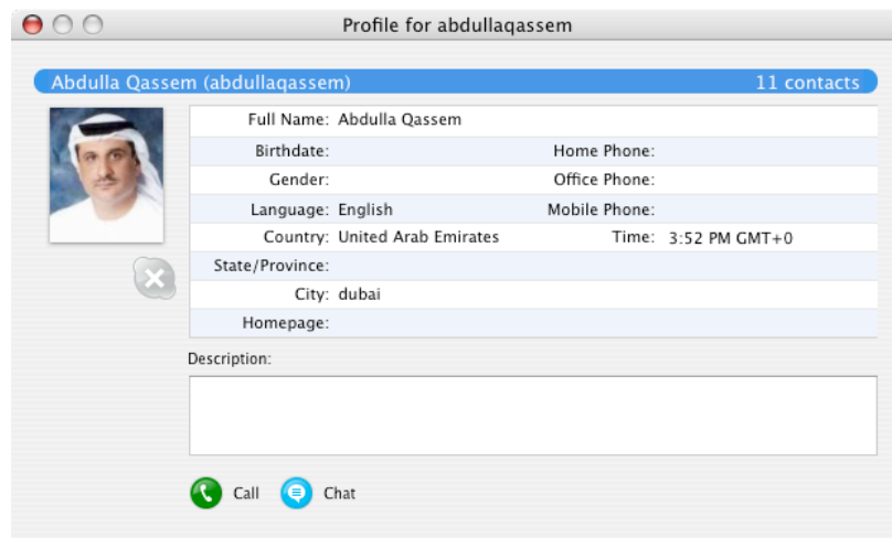
Figure 10 - Not the real Abdulla Qassem (Skype User Profile)

Using this data, we are able to have Ecademy suspend the account of Abdulla Qassem, while we begin trying to talk to him via Skype Instant Messaging (Figure 10).