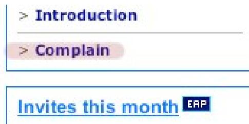
Figure 12 - The all important Ecademy Setting

ure 12), or it requires the user to navigate to Customer Service and lodge their issues, it needs to be readily available to the average user, and simple enough for them to rapidly find it and lodge an issue.