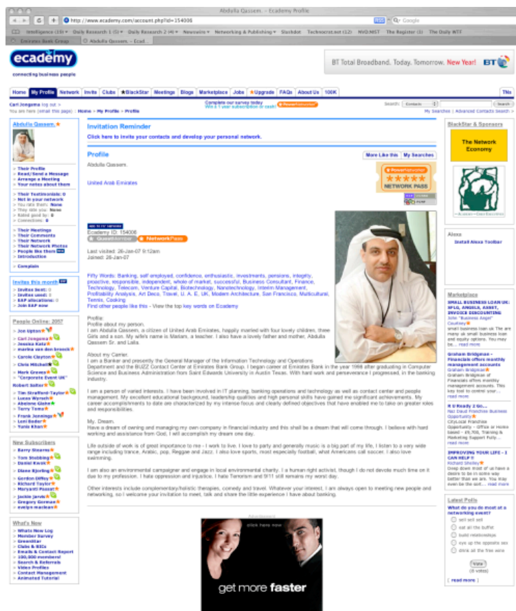
Figure 1 - The Ecademy account as it was

Not only did we need to validate the identity of the Ecademy Abdulla Qassem, but we also needed to develop a basic trust level based on how different information sources presented data on Abdulla Qassem. Relatively quickly we became suspicious that the Ecademy profile (Figure 1) was an almost word-for-word match for a corporate profile provided on the Emirates Banking Group website (Figure 2). The significant discrepancy between the supplied email addresses and what could be found via major search engines also was a cause for initial concern.